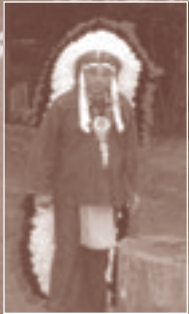
Look for Chief Red Cloud telling Indian stories around the campfire.

Up to 10 people can occupy one campsite.